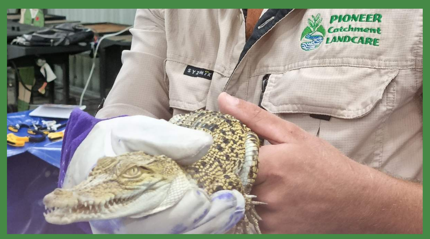
in photo: Reptile Handling Workshop