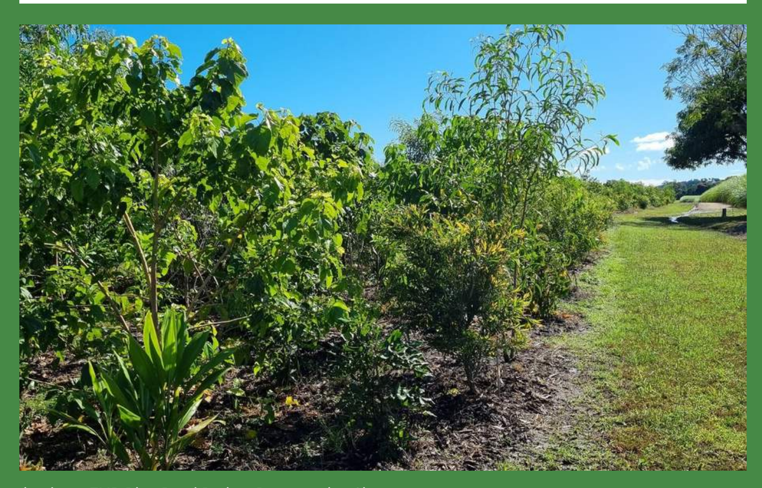
in photo: TMR Ring Road Project Revegetation Site

Our most successful commercial project to date has been our Transport and Main Roads (TMR) Ring Road Project which has funded the employment of four new field team members and the revegetation of 2.1 acres of land alongside the new Ring Road in Mackay. PCL has also secured funding for an extension to this project in collaboration with the Yuwi Aboriginal Corporation.